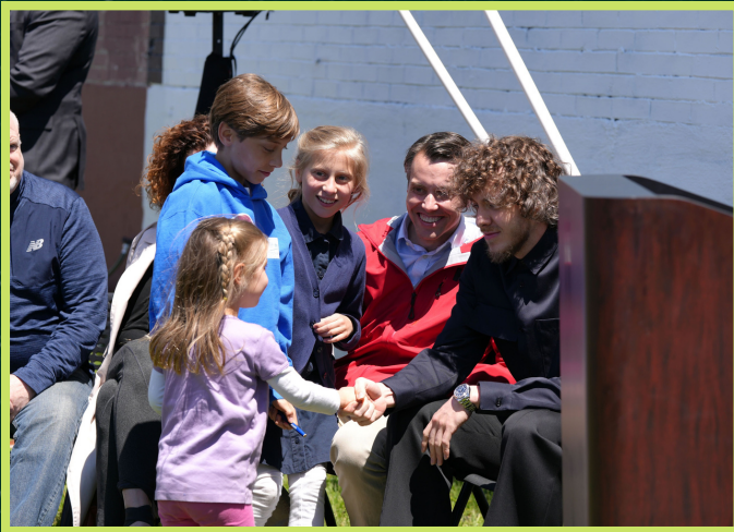
McGARVEY FAMILY GREETES HOMETOWN HERO JACK HARLOW