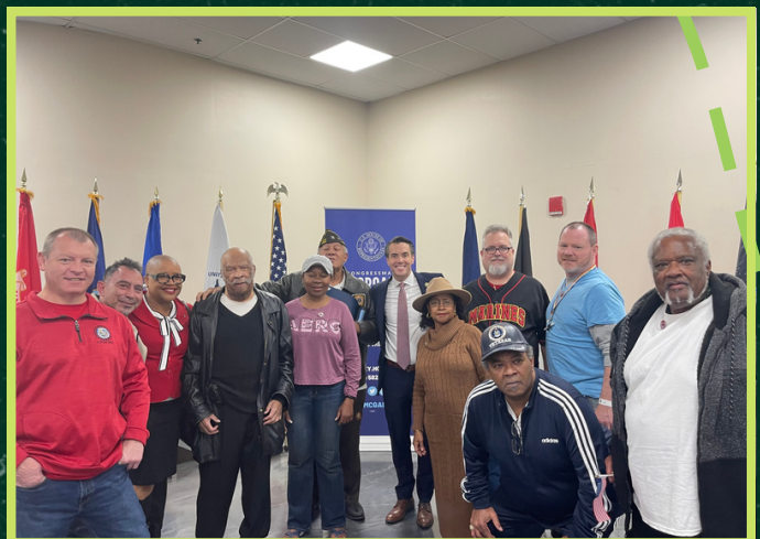
McGARVEY HOSTS FIRST ANNUAL VETERANS DAY BREAKFAST