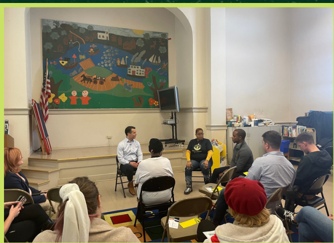
McGARVEY HOSTS LISTENING TOWN HALL IN NEWBURG