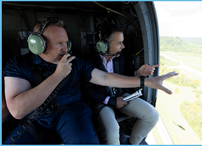
McGARVEY VISITS FORT KNOX