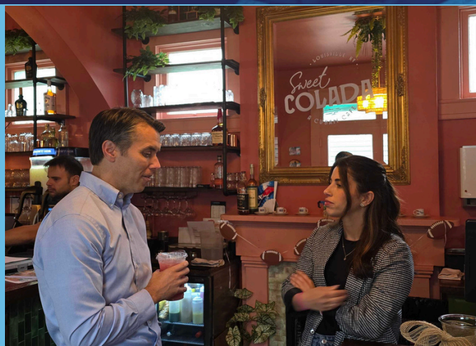
McGARVEY VISITS LOCAL SMALL BUSINESS