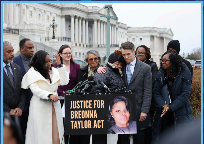
McGARVEY REINTRODUCES JUSTICE FOR BREONNA TAYLOR ACT