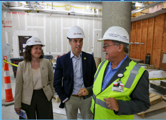
McGARVEY + GIFFORDS TOUR UofL HEALTH CONSTRUCTION