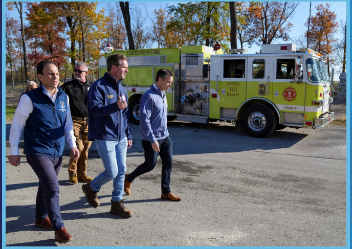
McGARVEY JOINS RESPONSE TO UPS FLIGHT 2976 CRASH