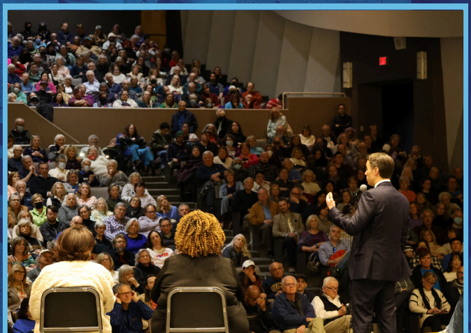
McGARVEY HOSTS TOWN HALL AT BALLARD HIGH SCHOOL