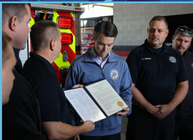
McGARVEY HONORS OKOLONA FIRE DEPARTMENT